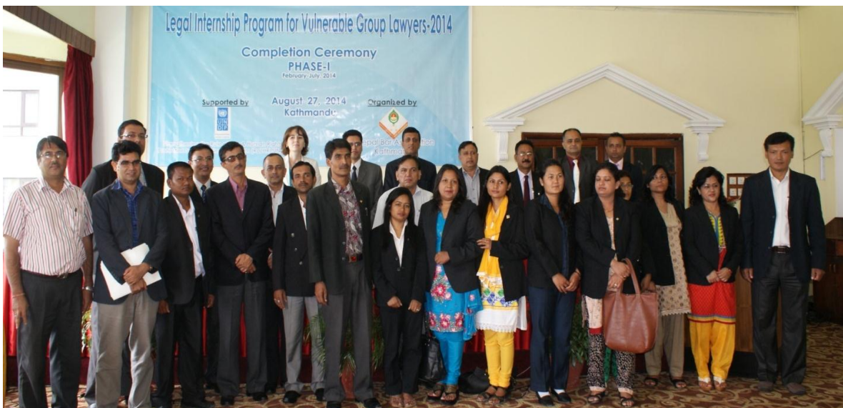
Graduation Ceremony of the Interns