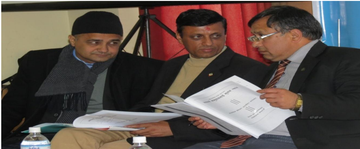
Discussion between NBA executives during Internship guideline & Course module development Program